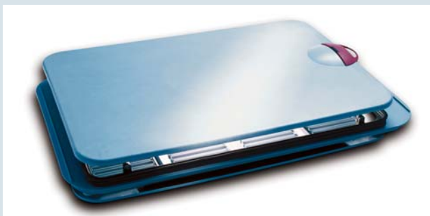
Diagram: BusTop Premium opened, with internal lining for cover.